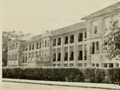
English Girls' High School, Rangoon